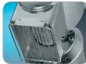
Griglia di protezione/rullo inox per GF Protection grate/stainless steel drum for GF