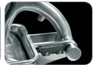
Microinterruttore su leva Micro-switch on lever